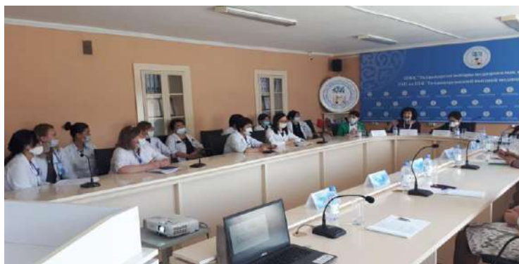
Photo 3. EEC conducts an interview with the chairperson of the CEP and the heads of the offices.

Members of the EEC visited the museum, college dormitory, first-aid post, sports and assembly halls. The information support department, consisting of three computer classes, was examined (50 computers connected to the Internet and 2 interactive panels are involved in the educational process).