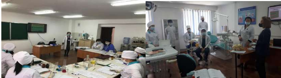
Photo 8. Visiting EEC practical training.

The attended lesson is provided with a working curriculum, control and measuring instruments, demonstration and handouts, equipment for individual practicing of practical skills.