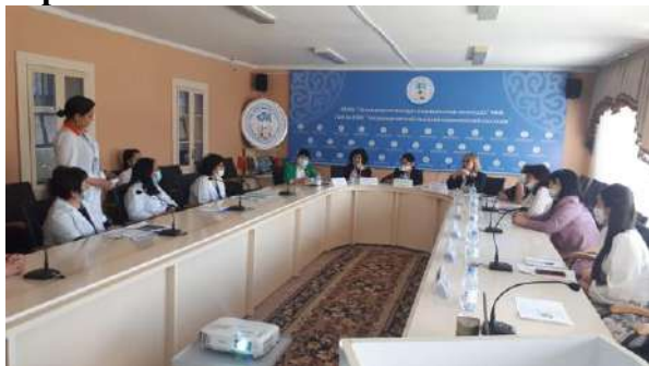
Photo 2. EEC conducts an interview with the management of the college and heads of departments.

- operation of a medical center, job duties of a paramedic of a medical center.