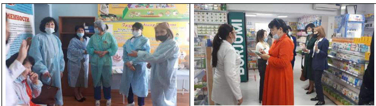
Photo 7. Visiting EEC clinical sites.