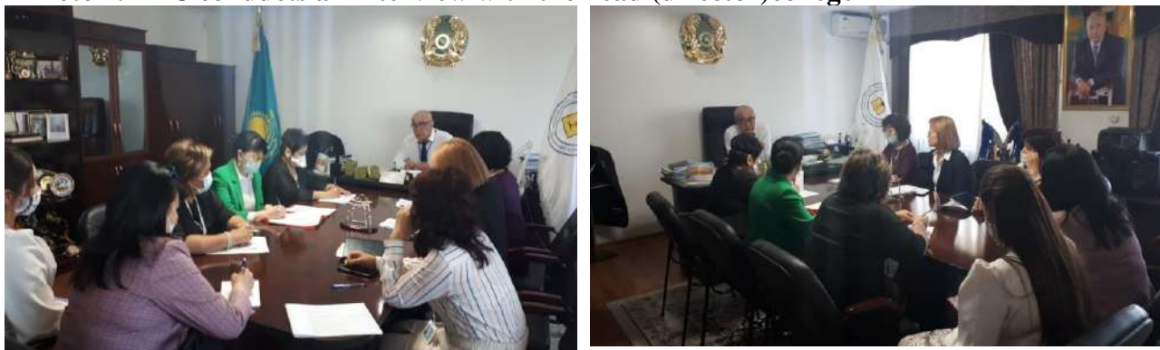
Photo 1. EEC conducts an interview with the head (director)college