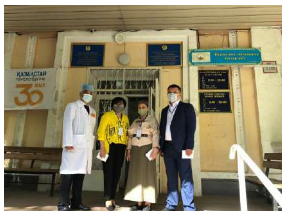
Photo 7. Visiting the practical bases of the college

The experts received convincing evidence that all the necessary conditions for mastering professional competencies have been created at the RHMC clinical sites.