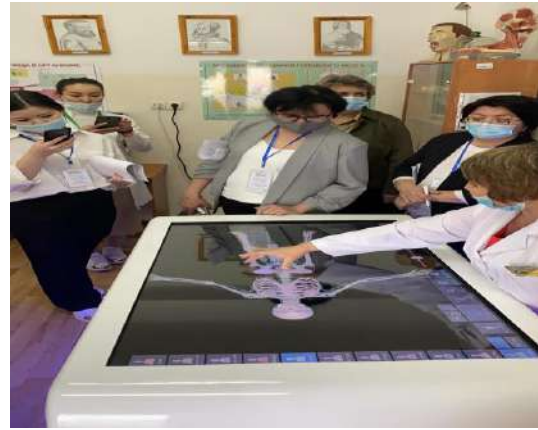
Photo 6. Overview of college resources

Further, an assembly hall with a total area of 152.4 square meters for 156 seats, equipped with modern multimedia and musical equipment, was examined.