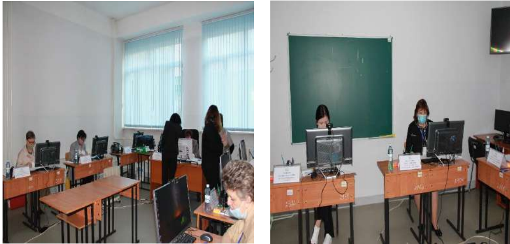
Photo 1. Organizational meeting of the EEC

Demonstrated information on community service, graduate employment, faculty and college resources. Were asked in surveys to the college director regarding the college's mission and strategy, financial sustainability and staffing, topical issues of interaction with the health care sector, cooperation with clinical sites, the correspondence of the college mission with the global goals of public health policy and the goals of accredited educational programmes, as well as members of EEC was interested in the financing of programmes by year, how the search and recruitment of teachers is carried out and what development programmes exist (School of a beginner teacher, internships), the prospects for the further development of those educational programmes that are most in demand and what activities are carried out for those programmes that are to a lesser extent interested in applicants.