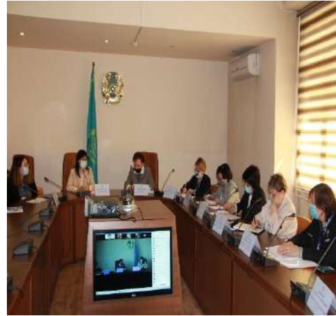
Photo 2. EEC conducts an interview with heads of departments