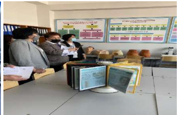
Photo 4. EEC meeting with the internal self-assessment team