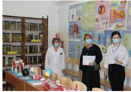
Photo 5. Overview of college resources (visit to the museum of anatomy)

Reviewed equipping classrooms departments in the specialties: "Nursing", "Medical care", "Applied Bachelor of Nursing", "Laboratory Diagnostics", "Hygiene and Epidemiology", "Pharmacy", "Dentistry", "Orthopedic Dentistry". There are 92 classrooms in total.