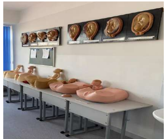
Photo 4. Overview of college resources

The Simulation Technology Center is largely equipped with modern digital mannequins, dummies and other equipment (Photo 4)