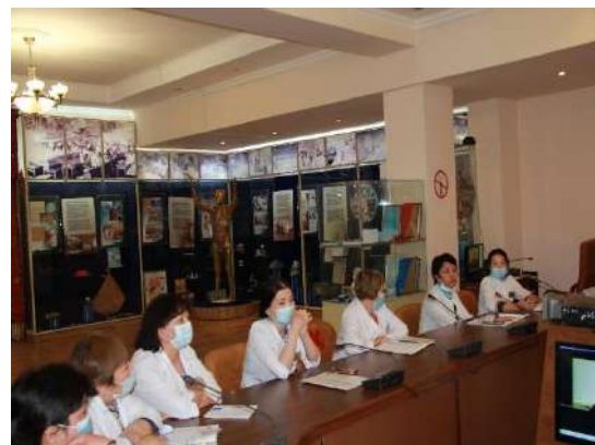
Photo 3: EEC conducts interviews with the chairperson of the CMC

The functions and tasks of the CMC, their role in methodological work, research support of students, interaction with other departments is discussed. The experts are familiarized with the position of the CMC, the responsibilities of the chairperson of the CMC, how the meetings are planned (work plan), the meetings are recorded. Questions were asked about approaches to reviewing and approving programmes (external and internal reviews, employers' feedback), the frequency of updating, taking into account the needs of practical health care (annually).