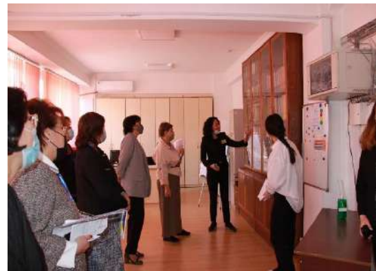
Photo 6. EEC meeting with the internal self-assessment team

Further, an assembly hall with a total area of 152.4 square meters for 156 seats, equipped with modern multimedia and musical equipment, was examined.