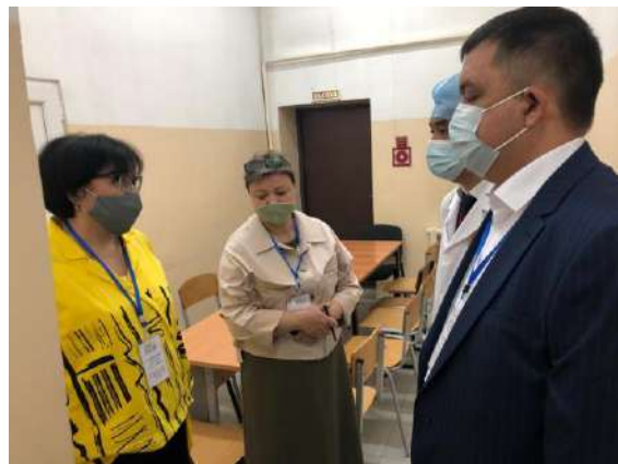
Photo 7. Visiting the practical bases of the college