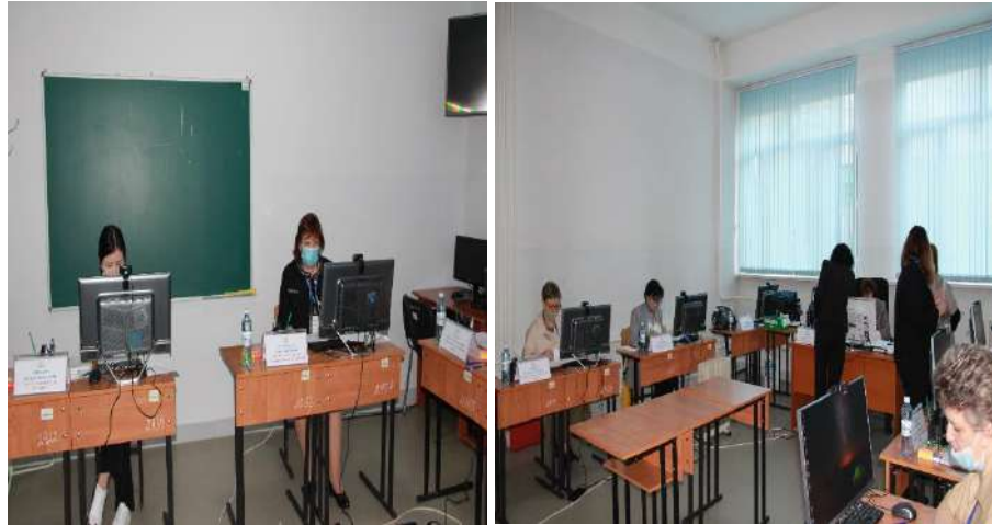
Photo 1. Organizational meeting of the EEC