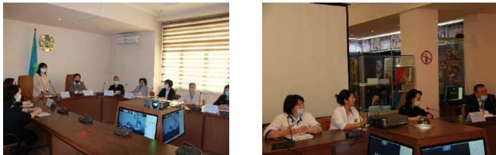
Photo 2. EEC conducts an interview with heads of departments