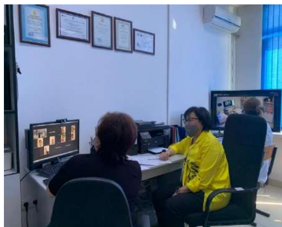
Photo 8. Attending a practical lesson

To conduct practical classes, the teachers had educational and methodological material, work programmes, CTP, appropriate technical and material equipment. All practical classes were conducted at a high level, which confirmed the competence of the teaching staff of the college.