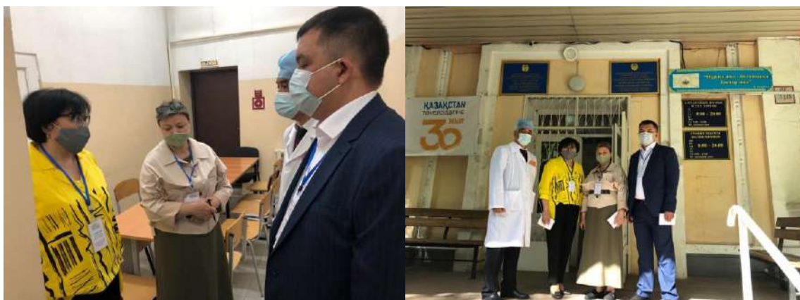
Photo 7. Visiting the practical bases of the college

Invivo "in 2021 will provide jobs for 15 graduates of the specialty" Laboratory diagnostics "and 40 graduates of the specialty" Nursing ".