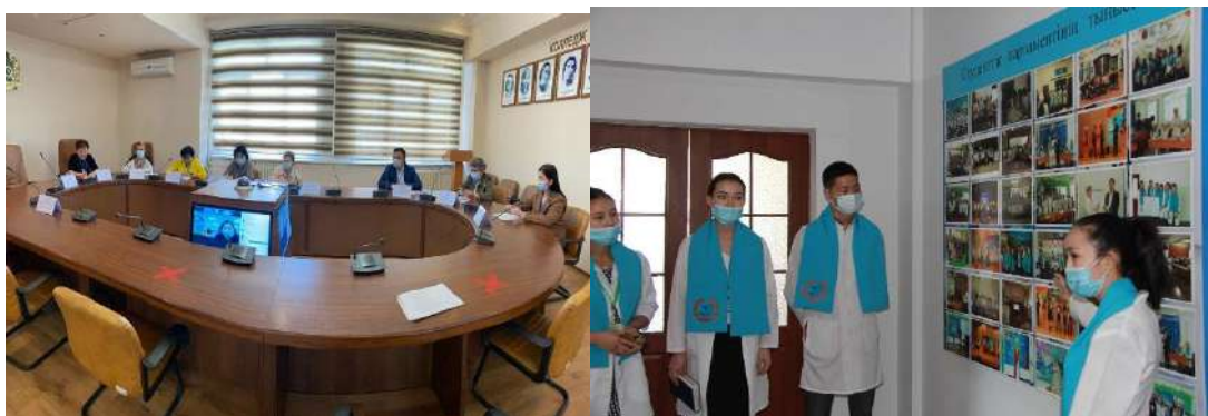
Photo 9. Meeting of EEC with representatives of student activists and student Parliament

Then, according to the programme of the visit, the experts evaluated the work of the medical office. Nurse - Sharipa Zh.K. When examining the medical office, it was found that in the context of the COVID-19 pandemic, there is no isolation ward in the college and the sanitary and anti-epidemic measures are not fully observed.