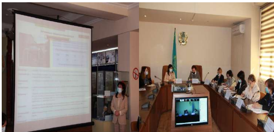
Photo 2. EEC conducts an interview with heads of departments