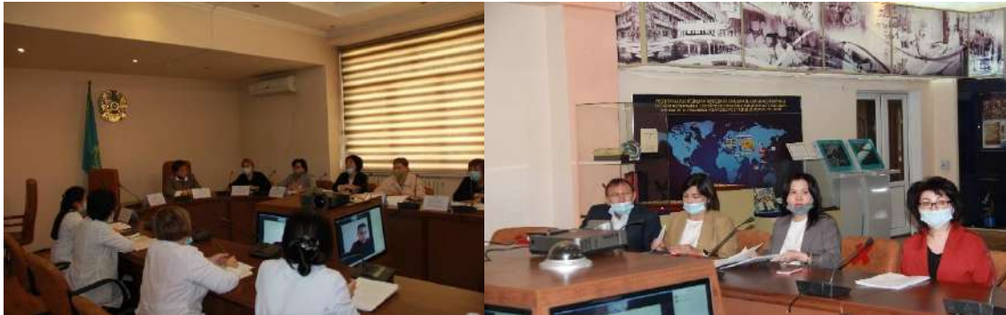
Photo 3. Meeting of the EEC members with the chairmen of the CMC and representatives of the support service

The functions and tasks of the CMC, their role in methodological work, research support of students, interaction with other departments are discussed. The experts are familiarized with the position of the CMC, the responsibilities of the chairmen of the CMC, how the meetings are planned (work plan), the meetings are recorded. Questions were asked about approaches to reviewing and approving programmes (external and internal reviews, employers' feedback), the frequency of updating, taking into account the needs of practical health care (annually).