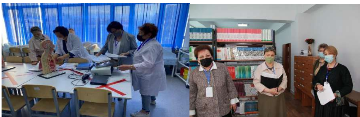
Photo 4. EEC meeting with the internal self-assessment team