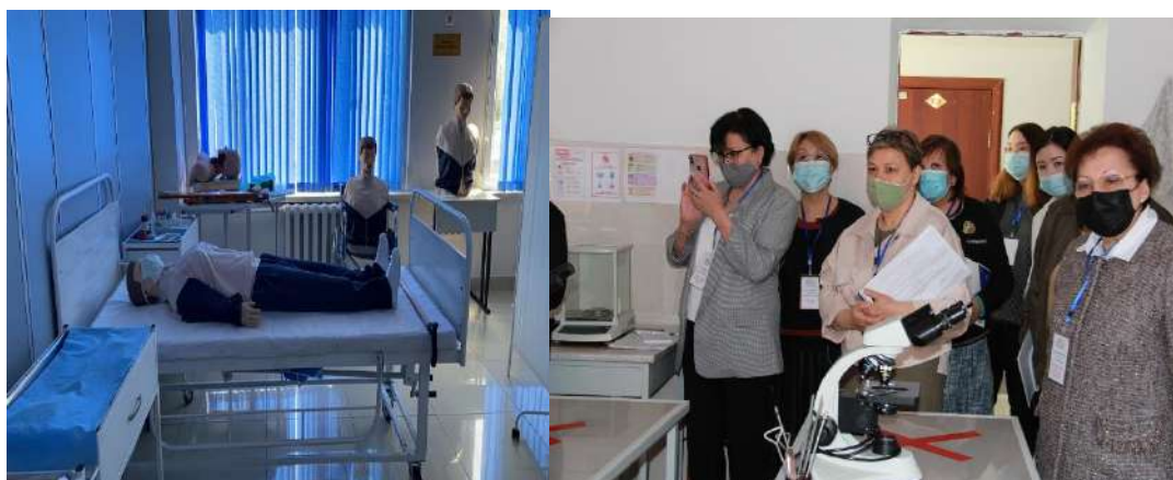
Photo 6. Overview of college resources

The experts received indisputable evidence of sufficient material and technical equipment of all classrooms to conduct practical exercises and ensure the educational process as a whole.