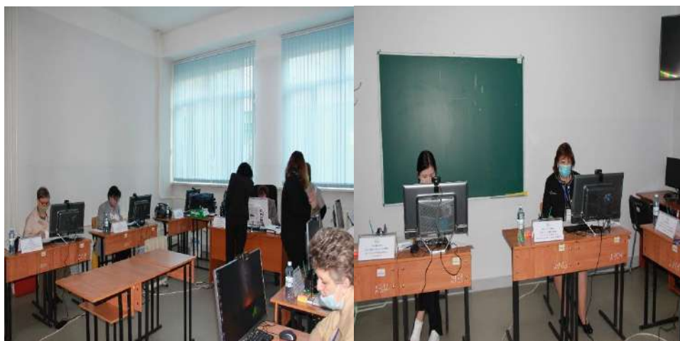
Photo 1. Organizational meeting of the EEC