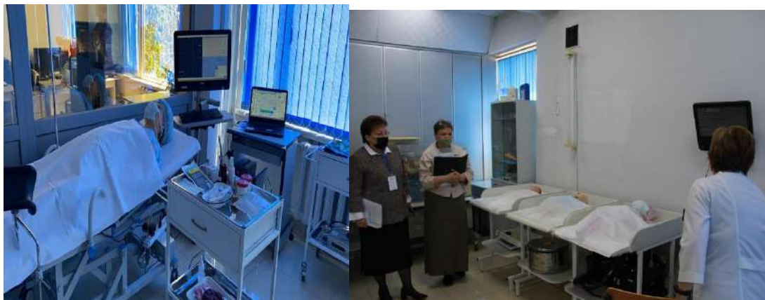
Photo 5. Overview of college resources

The Center for Simulation Technologies is largely equipped with modern digital mannequins, dummies and other equipment (Photo 4,5).