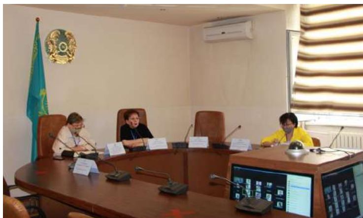
Photo 7. Interview with teachers

first category - 34%, the second category - 31.9%, with an academic degree - 12.8%.The share of teachers with a pharmaceutical education is 22.9%.