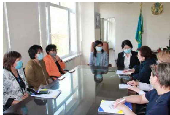
Photo 14. Familiarization of the RHMC management with the recommendations of the EEC

After an interview with college graduates, an interview was held with the employees responsible for the areas of work of the college at the request of the members of the EEC.