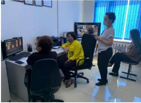
Photo 9. Visiting practical classes online