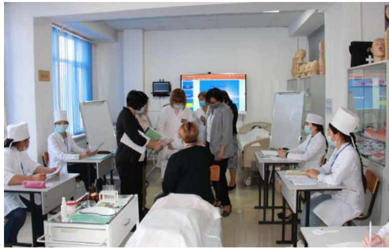
Photo 3. Attending a practical lesson at the Center for Simulation Technologies

specialty "General Medicine" (Obstetrician) on the topic "Methods of examination for gynecological diseases" (photo 3).