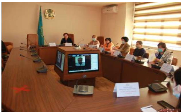
Photo 13. Interview with college graduates