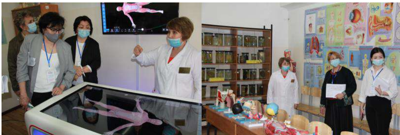
Photo 4. Museum of Anatomy

Reviewed equipping classrooms of departments in the specialties: "Nursing", "General Medicine", "Applied Bachelor of Nursing", "Laboratory Diagnostics", "Hygiene and Epidemiology", "Pharmacy" (photo 5), "Dentistry", "Orthopedic Dentistry". There are 92 classrooms in total.