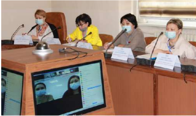
Photo 11. Interview with representatives and employers