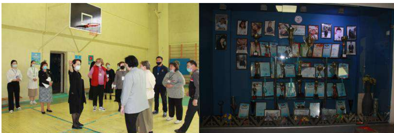
Photo 6. Sport halls

Further, in an online format, interviews with teachers took place (on the ZOOM platform). 61 teachers of the college took part (photo 7). Teachers answered questions about satisfaction with working conditions, wages, material incentives (bonuses, additional payments for leadership, methodological work, publications), talked about teacher development activities, noted the high corporate culture in the college and ethical leadership. Everyone noted that over the past three years, the appearance of the college has changed, equipment is being purchased, educational premises have been repaired. Teachers note the annual increase in wages, as well as moral incentives for employees.