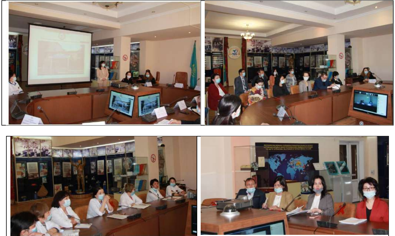
Photo 2. EEC conducts an interview with heads of departments