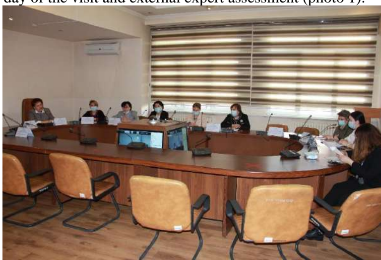
Photo 1. Organizational meeting of the EEC