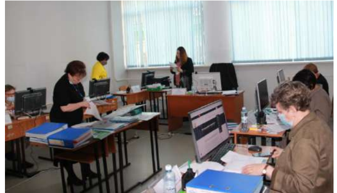
Photo 12. Study of documentation at the request of members of the EEC

One of the important elements of the external assessment procedure is the interview with employers - representatives of health care practitioners, which was conducted through the Zoom platform. Representatives of 21 clinical bases took part, who answered questions from experts on the demand for college graduates, their employability, competence, independence and organization (photo 11).