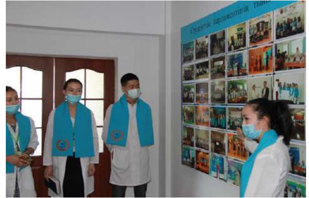
Photo 10. Interview with student activists